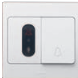
Do not disturb/Clean up bell push-button