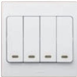
4 gang one way switch