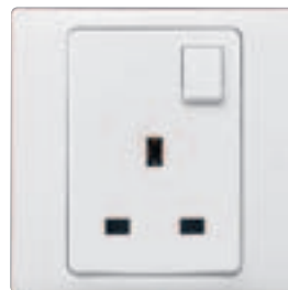
Socket outlet 13 A single pole, switched